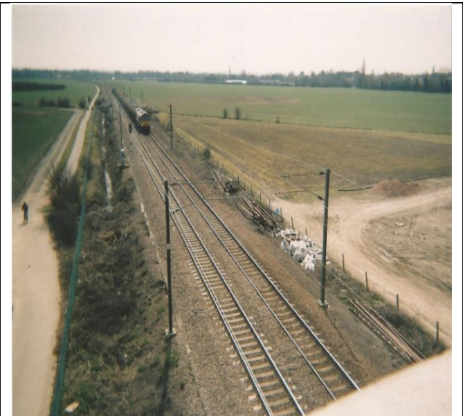
Caption above: Site of Addenbrooke's new station circa 2011. Since this was taken considerable redevelopment has taken place. ERTA calls for East-West Rail to link with this station and restore Trumpington Junction! These tracks need quadrupling at design stages!

agendas, please see our Blogspot and scroll down: https://ertarailvolunteer.blogspot.com/ We are reliably told by a colleague, that Shepreth Junction with be with a flyover or grade separated junction and quadruple-tracking between it and Cambridge to accommodate more railways and trains is the good news! For further news please see: https://www.eastwestrail.org.uk/ There will also be a new station 'Cambridge South' alias Addenbrookes!